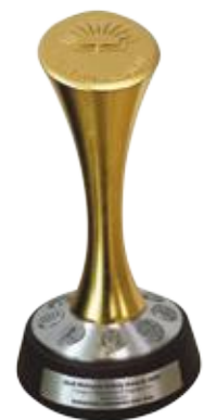
Shell Malaysia Safety Award (SMSA)

Anugerah Bunga Raya Perdana Menteri (PMHA)