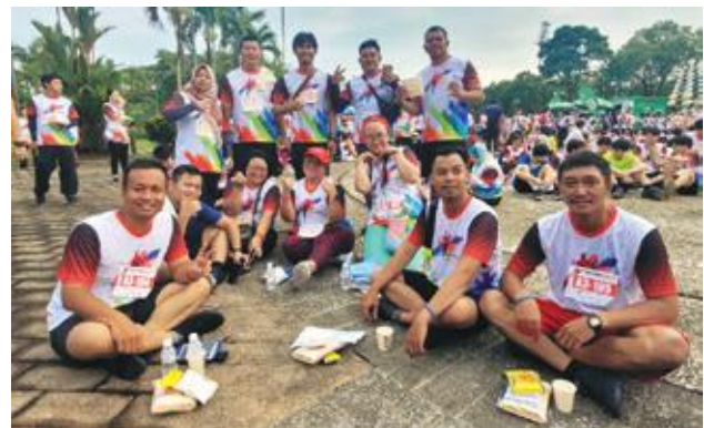
Trienekens team at RUN TO SAVE LIVES 3.0. Pasukan Trienekens di RUN TO SAVE LIVES 3.0.

Trienekens telah menyertai "RUN TO SAVE LIVES 3.0" yang dianjurkan oleh Persatuan Bulan Sabit Merah Malaysia pada bulan Jun untuk menyokong usaha pengumpulan dana mereka untuk pelbagai kempen derma darah dalam komuniti. Penyertaan sebegini memberi peluang kepada pasukan Trienekens untuk bersenam demi kesihatan dan juga menyumbang kepada amalan yang mulia.