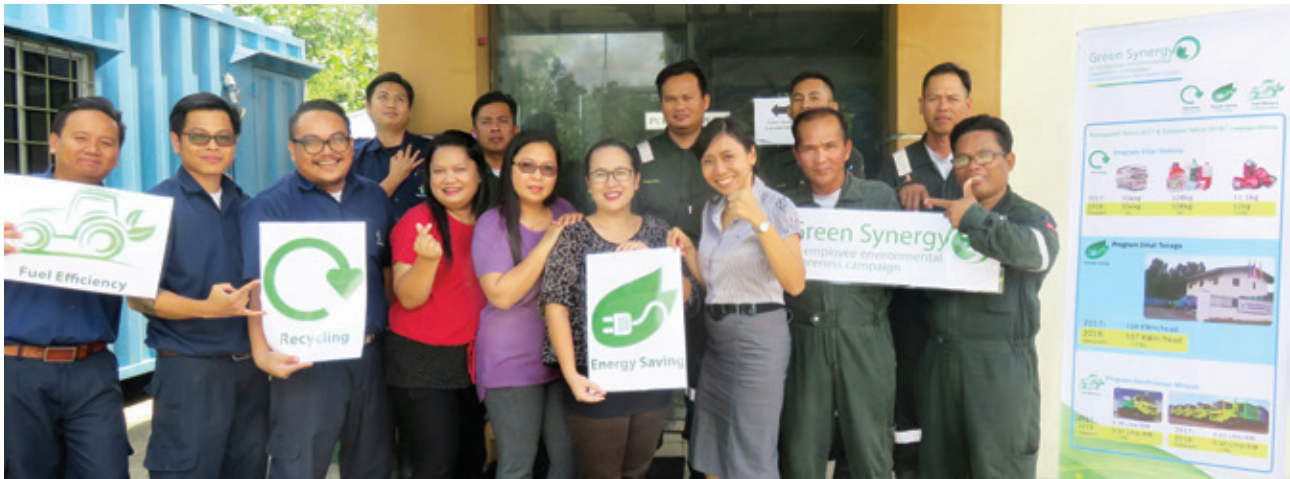
Bintulu Branch team members in high spirits after the 2018 campaign launch.

Anggota pasukan Cawangan Bintulu dalam penuh semangat selepas melancarkan kempen 2018.