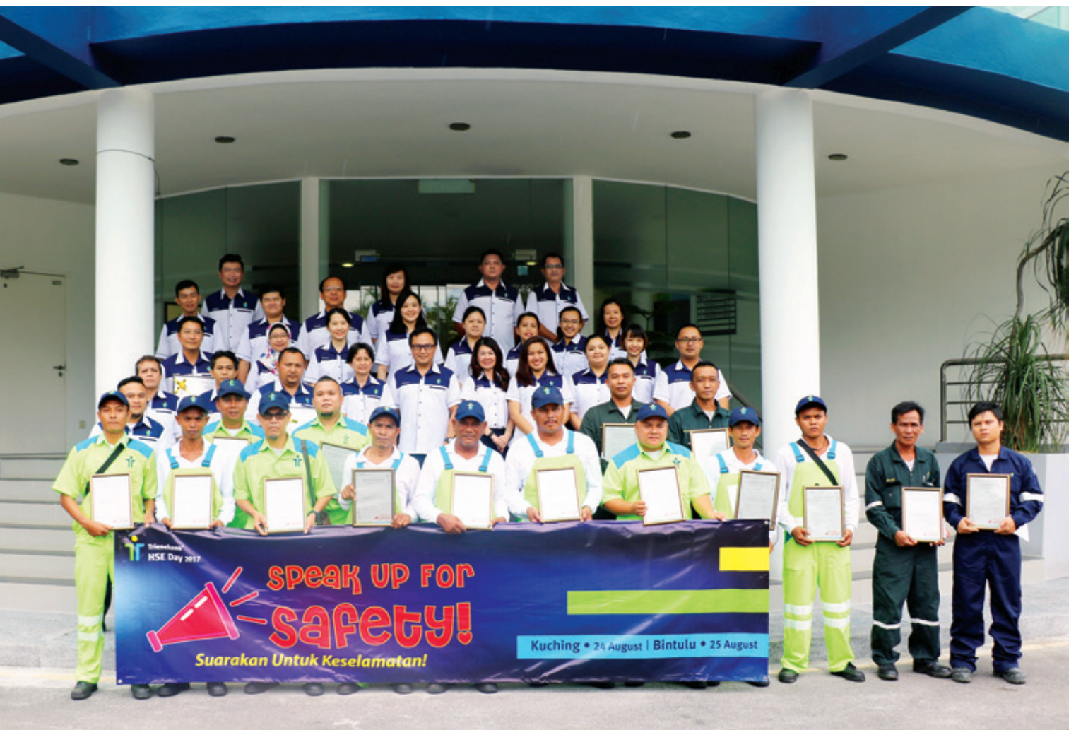
SPEAKING UP FOR SAFETY... Trienekens’ management and staff group together at the company’s HSE Day in Kuching. SUARAKAN UNTUK KESELAMATAN... Kakitangan Trienekens yang hadir pada upacara penutupan Minggu HSE di Kuching.