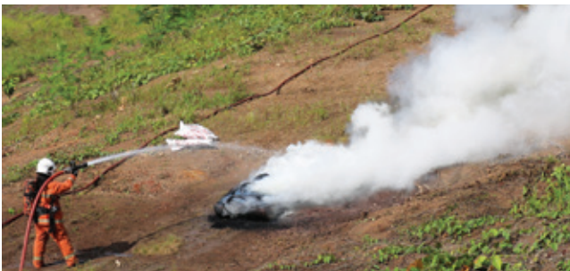
FRD Officers putting out residual fire spots Pegawai BOMBA memadamkan punca kebakaran.

While KIWMP's internal Emergency Response Team was mobilised to control the simulated fire spots pending the arrival and assistance of the FRD, area supervisors coordinated the evacuation of all other facility staff to the designated emergency assembly points. The drill, which was organised under the observation of Trienekens' HSE Division and Senior FRD Officers, ended with an assessment of the exercise and a fire safety refresher briefing.