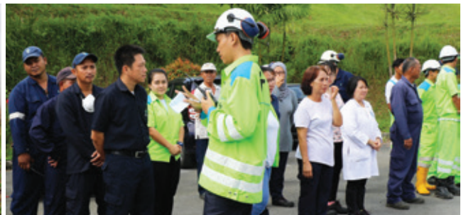
An Emergency Response Team member conducts a headcount to ensure all personnel are safely evacuated.

Sementara menunggu ketibaan dan bantuan pihak BOMBA, Pasukan Respons Kecemasan KIWMP telah digerakkan untuk mengawal punca kebakaran dan penyelia kawasan pula memindahkan para pekerja kemudahan ke tapak perhimpunan kecemasan yang telah ditetapkan. Dril yang dijalankan di bawah pemerhatian para pegawai Bahagian HSE Trienekens dan BOMBA diakhiri dengan satu sesi penilaian dan taklimat ulang kaji keselamatan kebakaran.